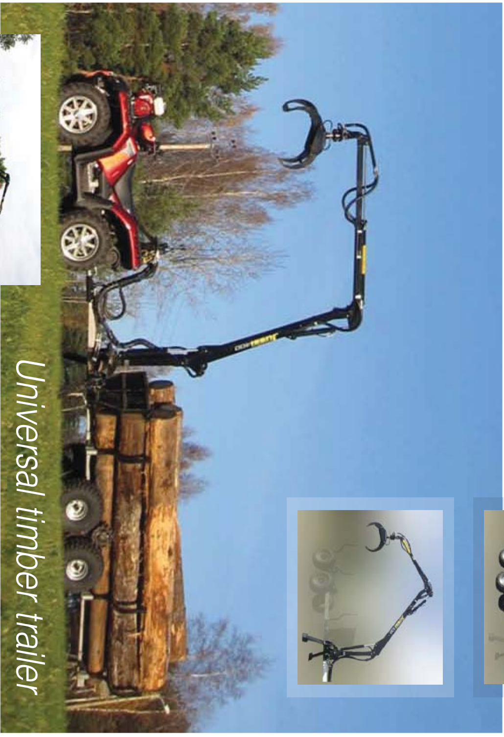
Universal timber trailer